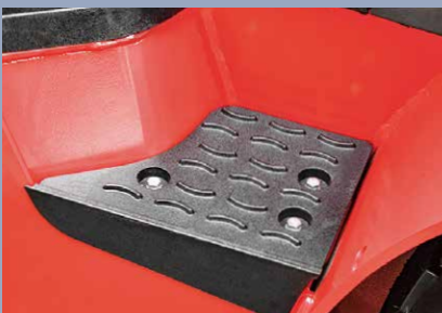
Enlarged boarding step space allows more convenience for boarding.