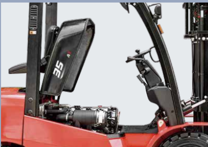
The wide-open hood, increasing maintenance space by 10%