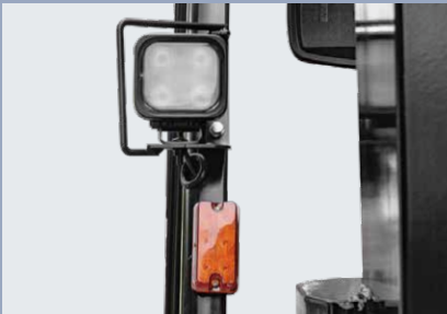
The LED lighting system is provided in the entire forklift, which can save energy and power and greatly improve the performance and service life of lights.