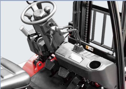
The semi-enclosed instrument console make the entire forklift look compact and stylish.